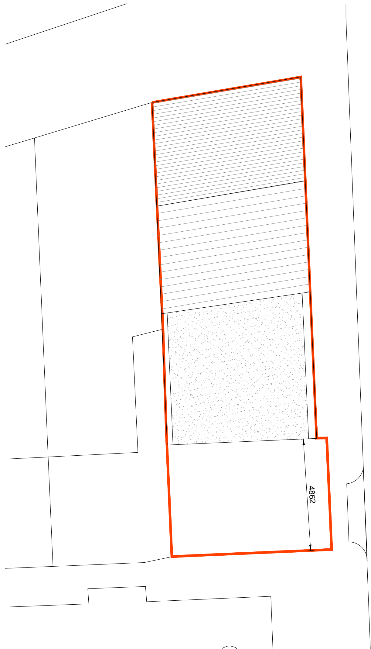
EXG SITE PLAN SCALE 1:100